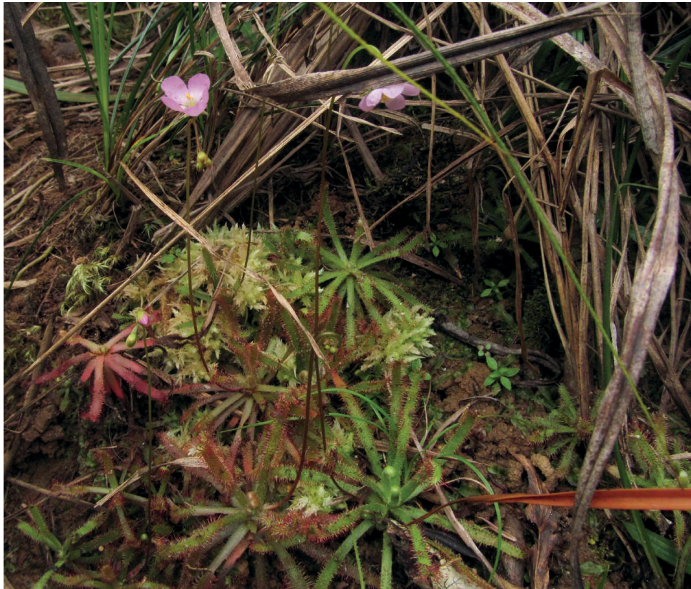
Figure 3 – Habit of Drosera arachnoides growing on red clayish soil among tall Cyperaceae.

Madagascar: [Prov. Antsiranana], Nord-Est, sommet oriental du Massif de Marojejy, à l’Ouest de la haute Manantenina, affluent de la Lokoho, gneiss et quartzite, 1850–2137 m alt., 17–20 Dec. 1948, Humbert 22771 (type of Drosera humbertii ; BM[BM000752944, https://data.nhm.ac.uk/object/2ff77f73-f2ef-4c96-83f7-9ec-2c123b50e/1586822400000 ], G, P[MNHN-P-P00374813, http://coldb.mnhn.fr/catalognumber/mnhn/p/p00374813 ], P[MNHN-P-P00374814, http://coldb.mnhn.fr/catalognumber/mnhn/p/p00374814 ], P[MNHN-P-P00374815,